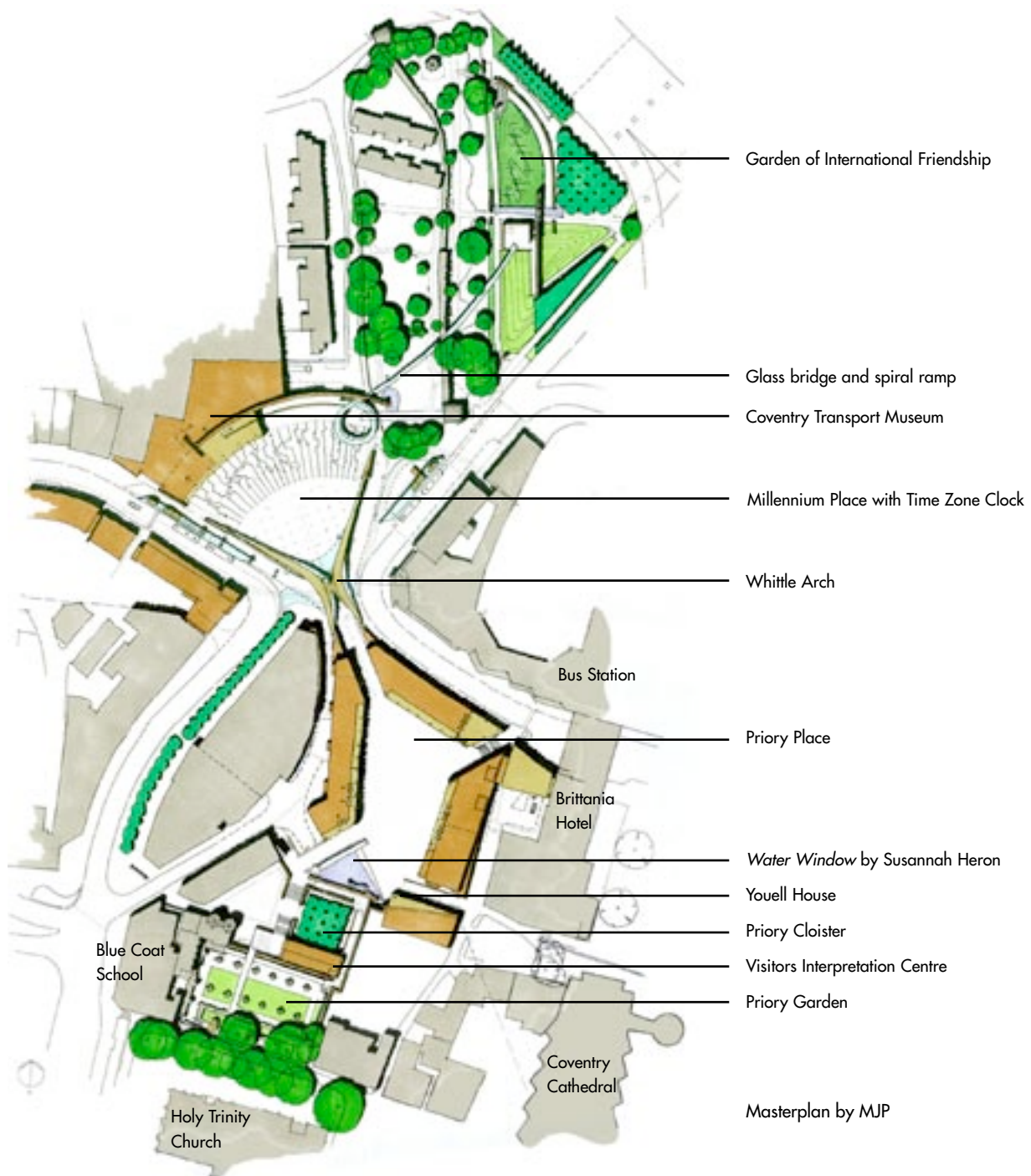
Masterplan by MJP

The 3ha site links two major visitor attractions; Basil Spence's Cathedral and the Coventry Transport Museum. Our project regenerates a previously neglected part of the city by creating a series of connected new public spaces.